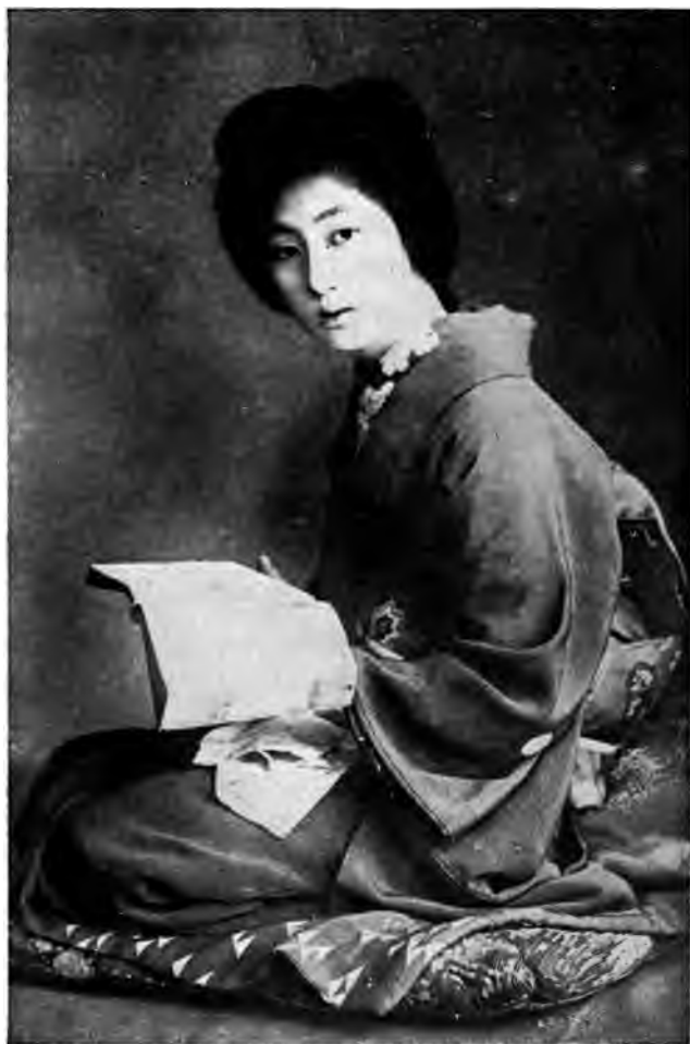
O HAMAYU (GEISHA) Most celebrated in Tokyo